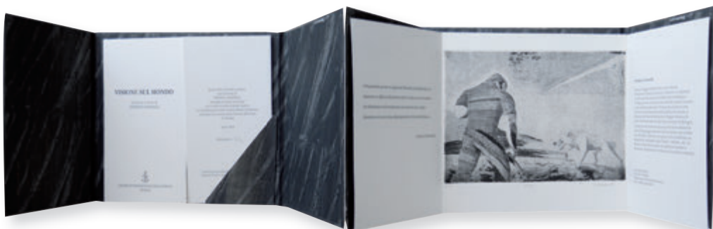
Stefano Grasselli - " Visione sul Mondo " - Etching. Artist explanatory text.