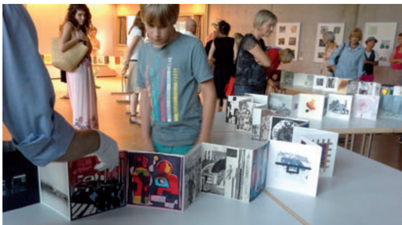
Various moments of the opening and displaying of the book.