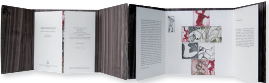
Bernd Hendl - " Metropolis - Der Turm zu Babel " - Engraving on several plates. Text in German: (vers.1Mosè 11,1,9 ).