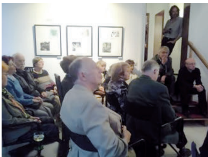
Exterior and interior of the Five Senses gallery.