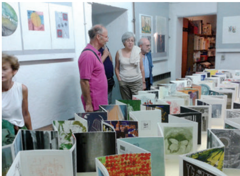
Metropolis was exhibited in Rome at the Associazione Internazionale Incisori.