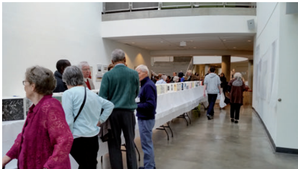
Two moments of the exhibition.