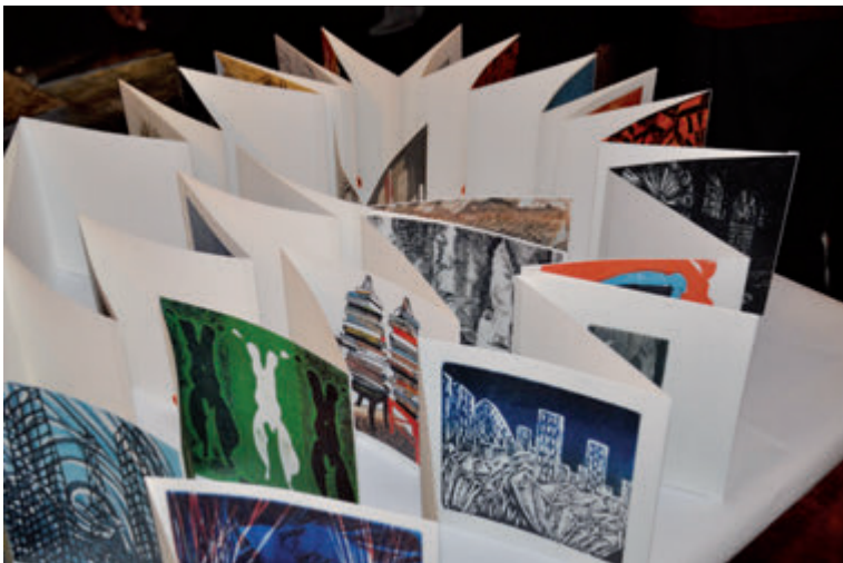
Another stop of the book in its American journey.