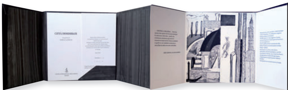
Isabelle Lavergne - " Città desiderate " - Etching / aquatint. Text from " Invisible Cities " by Italo Calvino.