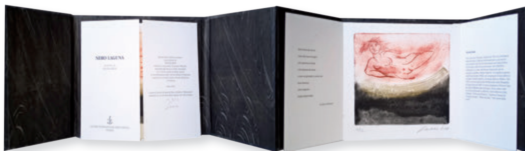
Nicola Sene - " Nero laguna " - Engraving in mixed media. Luciano Menetto poetry.