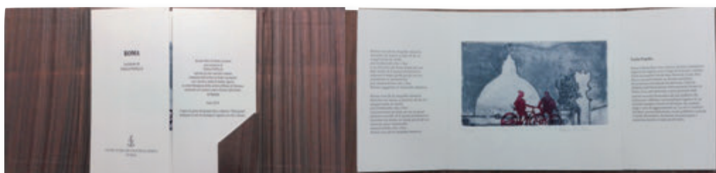
Paola Pupillo - " Roma " - Photo etching. Song "Roma" from the musical comedy Rugantino .