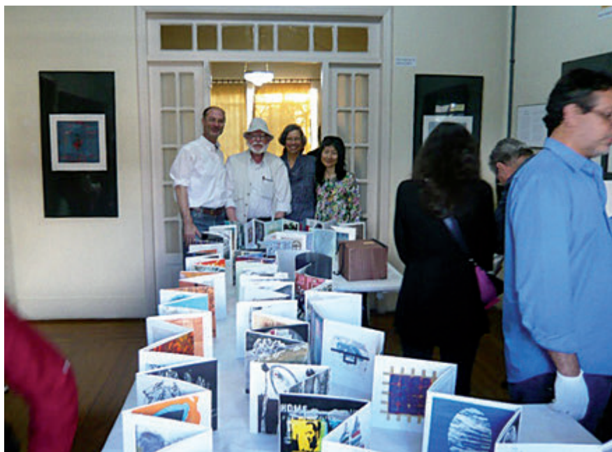
One of the original books was donated to the Casa de Xilogravura and will be housed in the Museum.