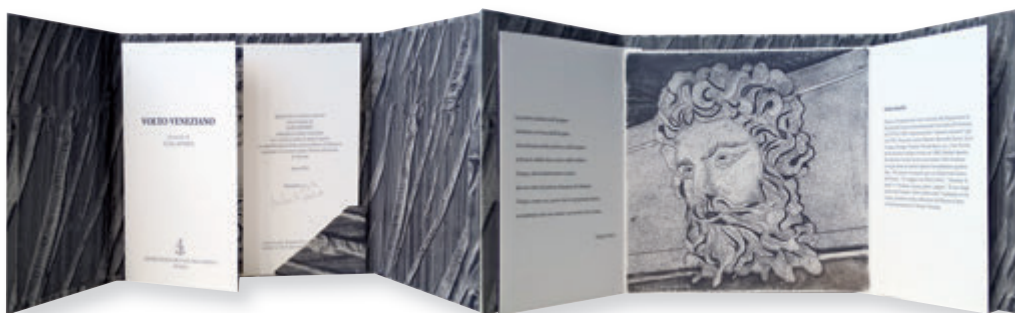
Luisa Asteriti - " Volto Veneziano " - Experimental etching. Poem by Diego Valeri.

The series of artist books will follow the collective book in its travels around the world and will be exposed in the galleries.