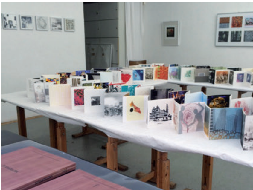
Exterior and interior of the Gallery