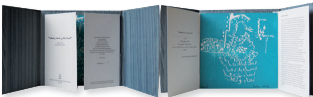
Soha Ben Slama - " Les femmes de mon pays " - Woodcut. Arabic poetry: Essghaier WLED Ahmed.