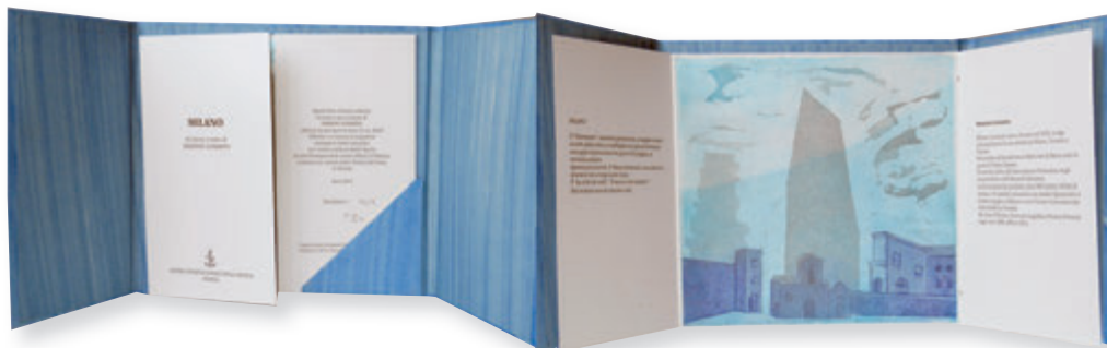
Massimo Lomasto - " Milano " - Aquatint on two copper plates. Text by the artist.