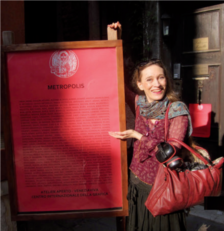
The French artist Marie Malherbe, one of the 303 Metropolis artists, invites us to follow the world itinerary of the book.