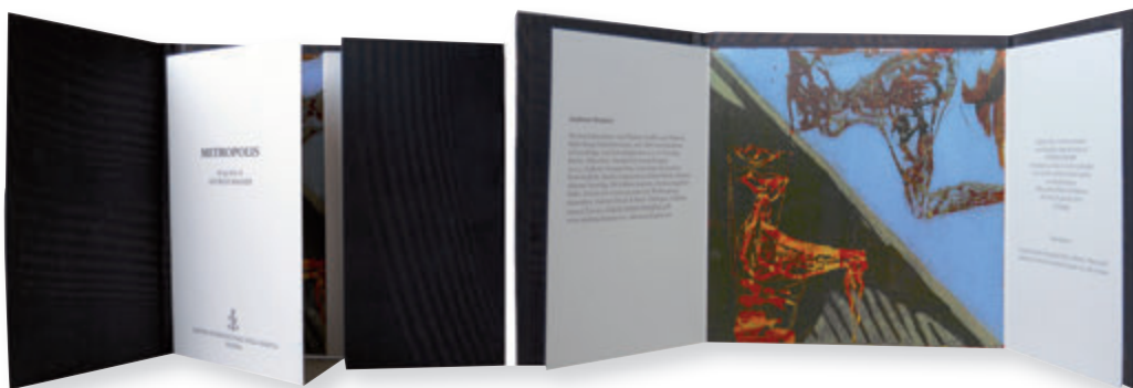
Andreas Kramer - " Metropolis " - Woodcut polychrome. Author's text (German language).