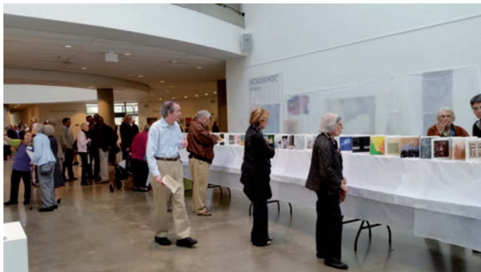
The woman on the right went through the display three times.