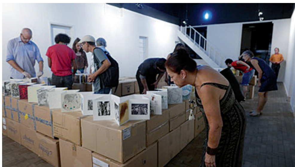
Moments of the exhibition