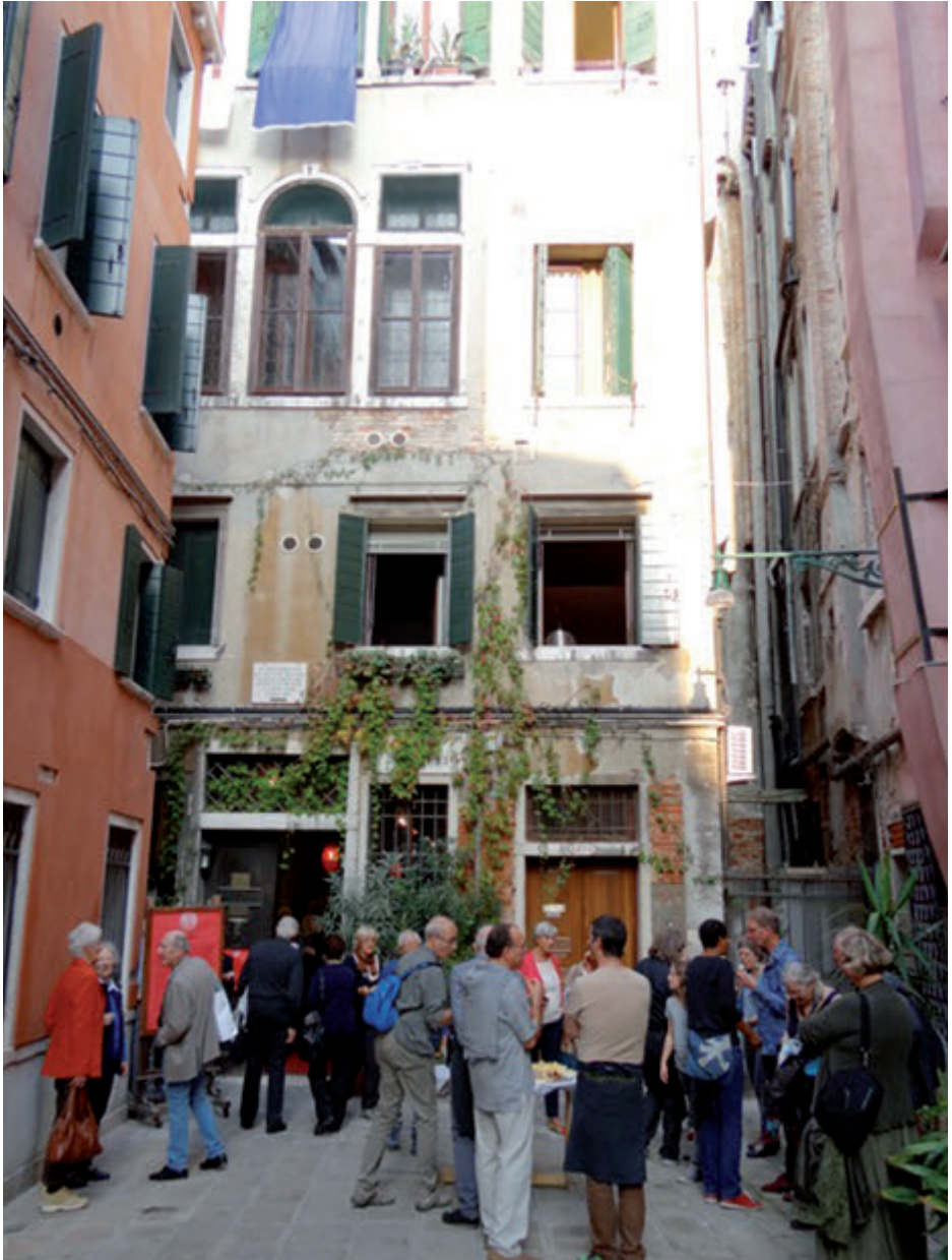
A moment of the inauguration on the outside of Palazzo Minelli.