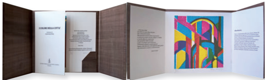
Alba Balestra - " I colori della città " - Engraving in three colors. Poem by Joyce Lussu.