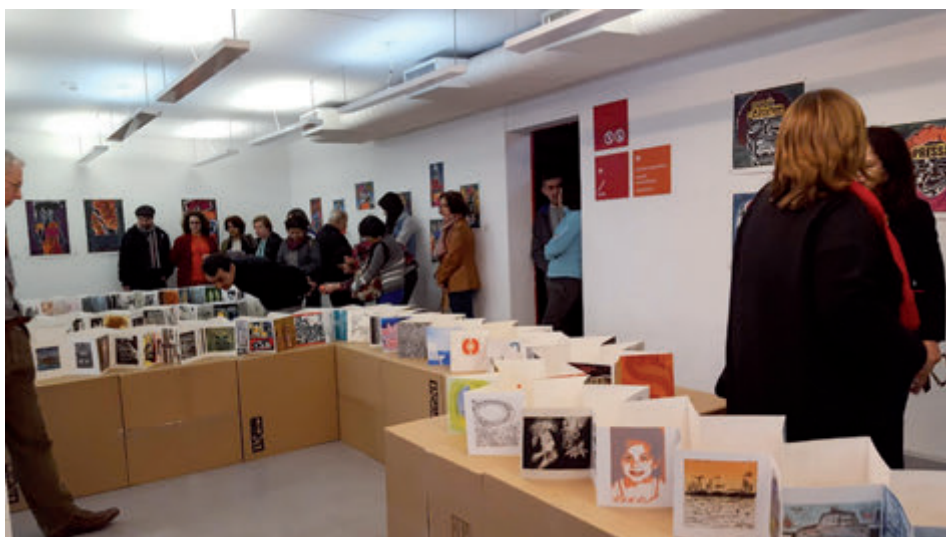
Moments of the exhibit.